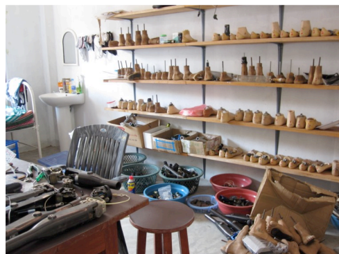
Limb Prosthesis Lab

In the years to come, we hope these youth will take a lead role in the activities of Sivan Arul Illam and the like so that we continue with this humanitarian work!