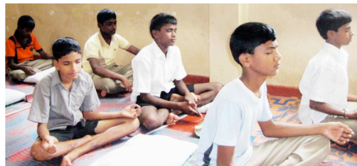
Meditation and Breathing Exercise Class

W elcome to our first news letter for 2010. With your donations, support and blessings Sivan Arul Illam has progressed with confidence with its humanitarian work. The children from IDP camps had clocked just over 6 months with Sivan Arul Illam and we pay our obeisance to the loving God for giving us this opportunity to care for these children. These children have progressively settling in, enjoying the friendly surroundings, extra curricular activities and benefiting by attending the school.