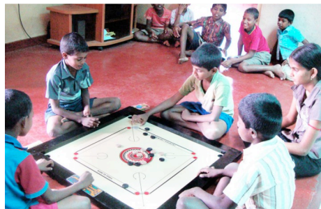
Kids are playing

Anyone from overseas interested in spending some time at Sivan Arul Illam and provide service to the children are kindly requested to contact us at sivanarulillam@gmail.com