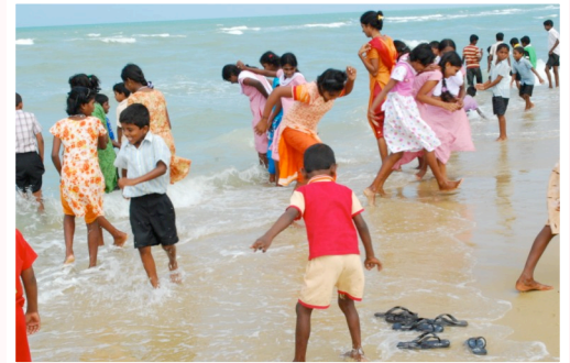
Children at Thalaimannar Beach